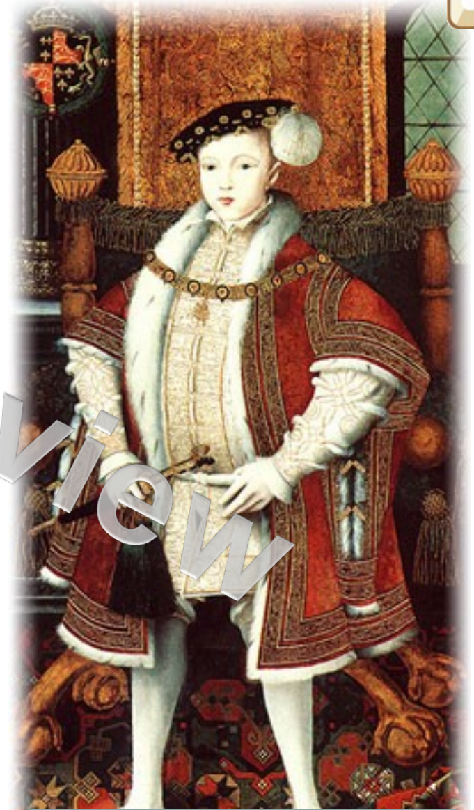
The New King

Edward VI ruled from 1547 to 1553, just six years. Edward died aged fifteen. His father was Henry VIII and his mother was Jane Seymour.